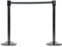
Stanchion with 7" Strap