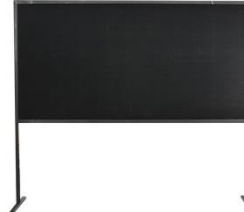
Horizontal Display Board